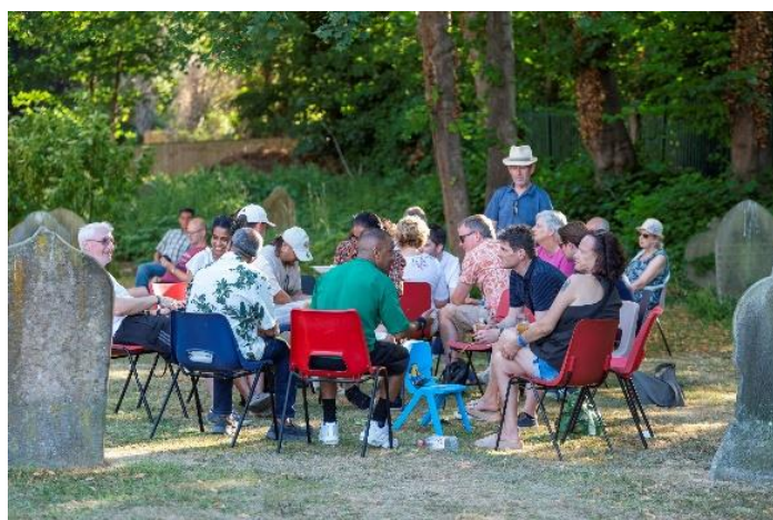
Beer Festival photos

My main focus in 2025 was the first Saint Benedict's Beer Festival, which took place in the hall and grounds at S. Mark's on 11th July 2025. This was a great opportunity to forge links with local businesses, musicians and other organisations to gain sponsorship and support. We also had local charities present to raise awareness of the work they are doing, and many of the people who attended the festival would not have otherwise set foot on a church site. This was a wonderful opportunity to show the church as 'alive' within our immediate community and beyond. The festival exceeded all expectations, raising £3400 towards the vital Mission Work of the Parish.